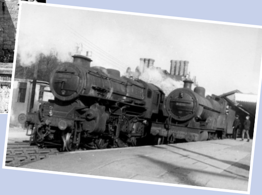
Two locos at Bletchley on 15 March 1952 are locally based Ivatt 4MT 43005 and Bedford's 4P 3-cylinder Compound 4-4-0 41038.