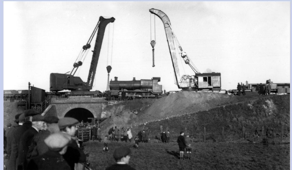
On 26 December 1920 Reading's 4300 class 5374 is being lifted back on to the track following a derailment at Little Johns which is the name of a nearby farm on the north side of the line on the Tilehurst side of Reading West. Damage has been inflicted to the parapet of the underline bridge. I have no further details of this incident. The loco ran as 8374 from January 1928 to July 1944 and was withdrawn in June 1948.