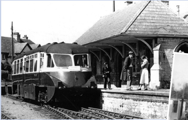
Reading's DRC W16W has arrived at Faringdon on a Southall Railway Club trip in April 1955.